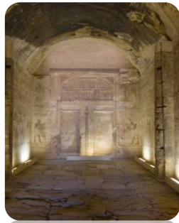
Inner Temples Dream Realm