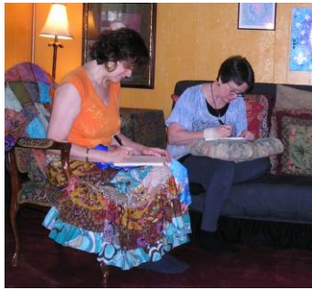
Journal Your Insights