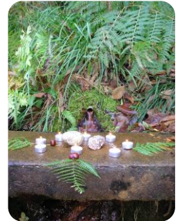
Gratitude & Closure