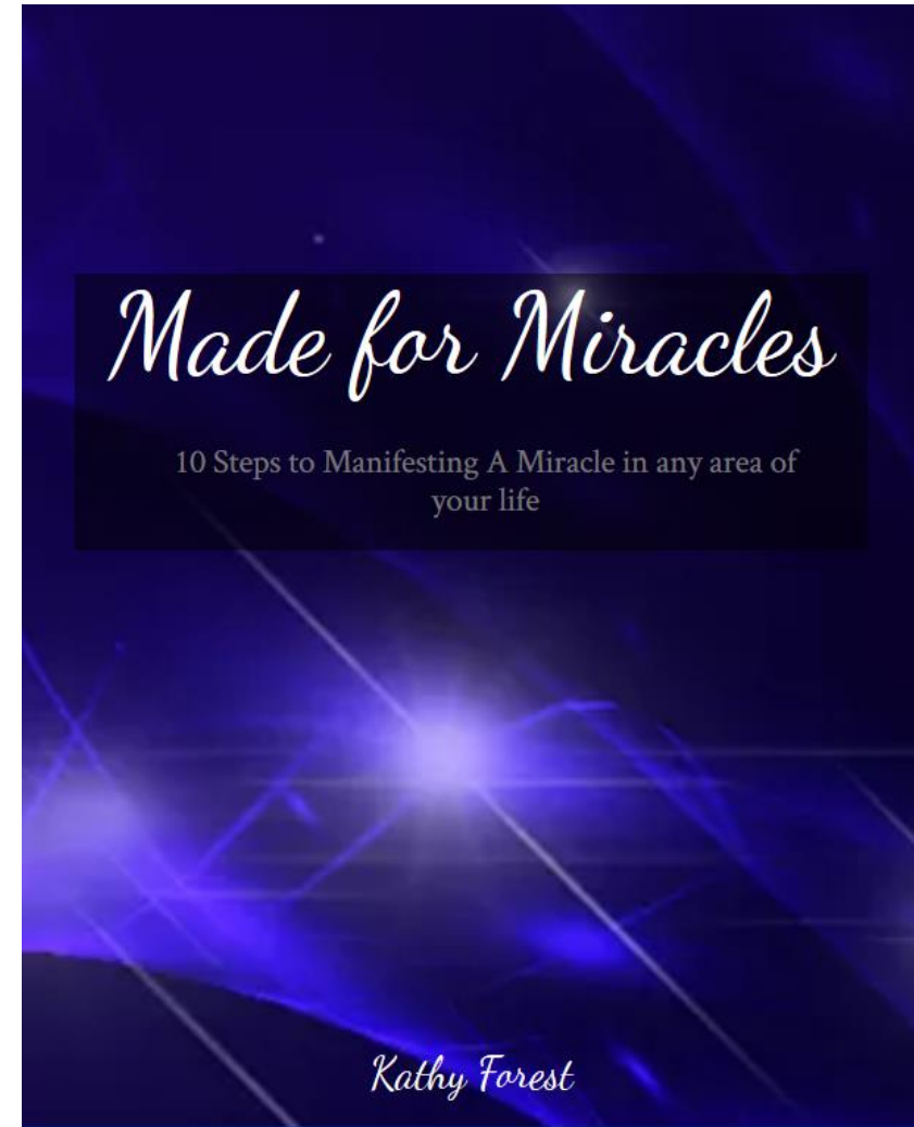
“Made for Miracles” Card Deck and E-Book